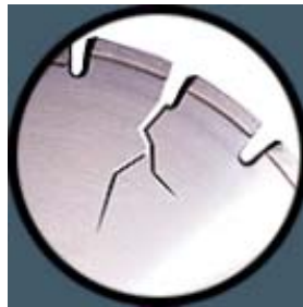
Fig. 5 “Cracked Core”

one of the most common blade failures is core crack failure. Core Cracks are a result of the stress put on the core at the root of the notch or gullet from the segments being pushed into the material at the point of initial contact and being pulled out of the cut at the end of contact with the material. This is analogous to bending a piece of wire back and forth till it breaks. Core cracking can not be stopped or eliminated. Blade manufacturers design the blade under normal operating conditions. If during cutting operations the blade is subjected to pounding, twisting, overheating, or other abnormal stresses, core cracks will develop prior to the blade being worn out. The presence of a visible core crack will render the blade unusable. The danger in using a core cracked blade is that for every visible crack there are several cracks that are not visible. Continuing to use a core cracked blade will result in catastrophic failure of the core causing large sections of the core to fly off at energy levels equal to a 22 caliber bullet. A core cracked must not be used . Fig 5 shows a core cracked blade that has two major cracks and several small cracks that under visual inspections may not be visible.