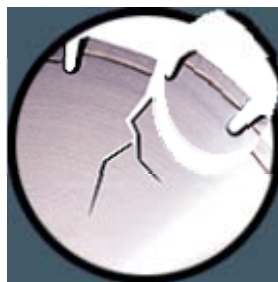
Fig. 6 “Core Crack progression”

The failure occurs almost instantaneously because the cracks progress slowly until the material separating the cracks can no longer withstand the stresses to it and then failure occurs at the speed of sound in steel which is 19,533.81ft/sec.