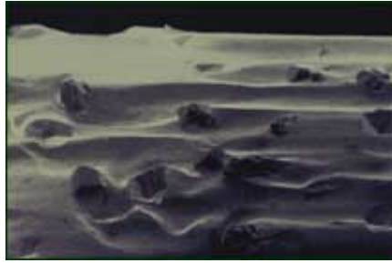
Fig 5 “Bond – Tail”

screwdriver the more it wants to slip out from between your fingers. To better utilize the diamond crystals in a segment the metal bond is designed to develop bond tails. This extra metal holds the diamond crystal in the metal bond longer and is the reason that bond tail development in a cutting segment is so important for blade performance.